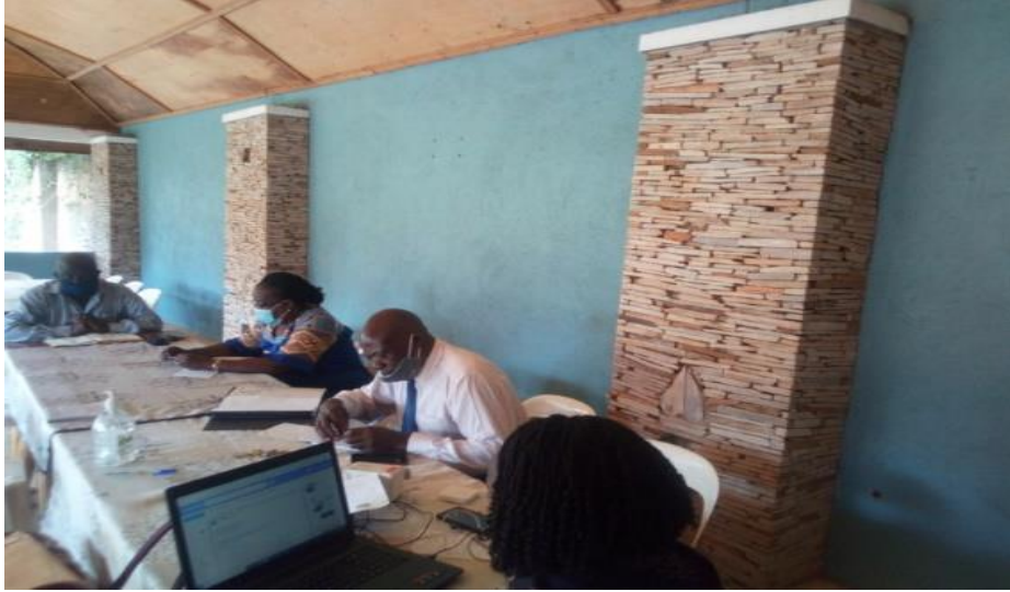
Above: Members of RUPOA and staff of FAPAD during a planning and consultative meeting.