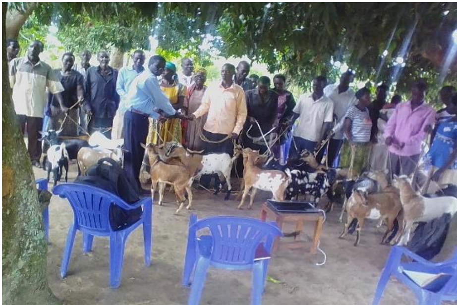
Above: FAPAD in coordination with local leaders handing over goats to Alummyomiwangi youth group

Contributing to youth employment is one of the key areas FAPAD prioritized in 2020. Despite the a challenging year, FAPAD economically empowered a total of 03 youth groups in Amolatar district. This was through supporting the youth with start-up kits to enhance their