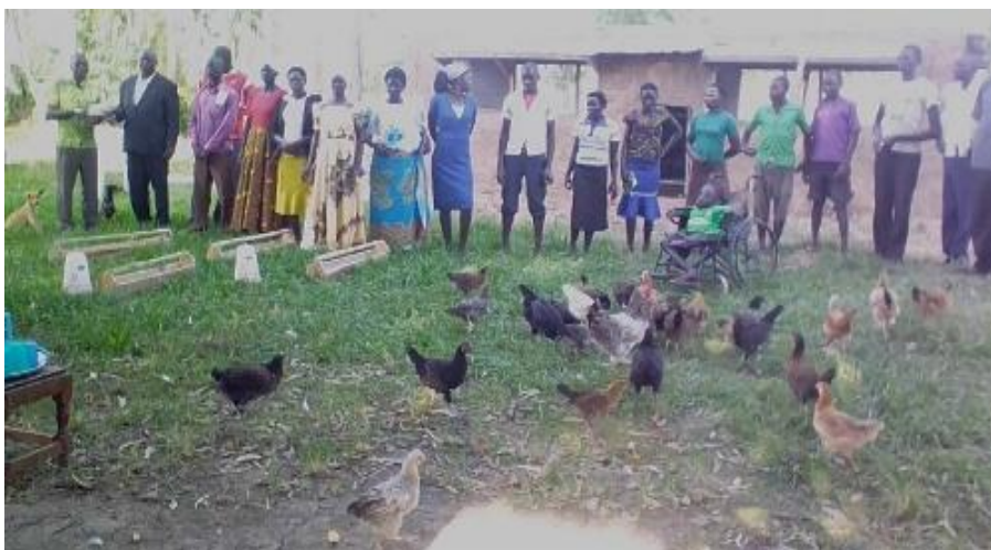
Above: Atomoro youth group receiving poultry from FAPAD during a hand over event

livelihoods. These inputs included goats, poultry and their assorted items. We supported one youth group to establish one community tree nursery bussiness to enhance their livelihoods and contribute to enviromental protection efforts.