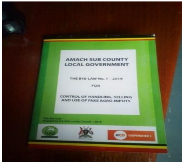
Above: A copy of the Amach sub county bye-law against counterfeit agro inputs

bye-laws against counterfeit-agro-inputs in the 05 target sub counties of Amach, Agweng, Agali, Barr and Ngetta. These policies are aimed at enhancing food, income and nutritional security, environmental and human rights protection.