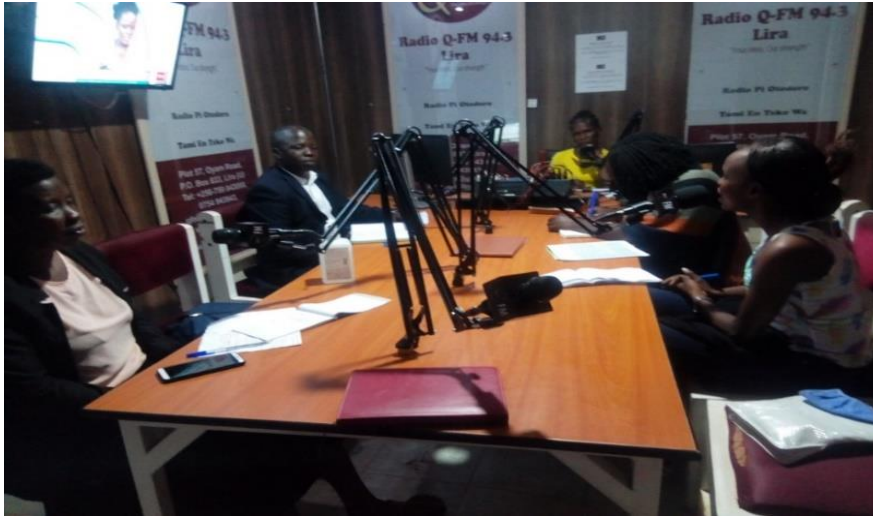
The leadership of North Kyoga Regional Police officers participating in a joint a radio talk show with FAPAD in Lira district

Following rampant cases of sexual and Gender Based Violence (GBV) especially during the lockdown as a result of COVID-19 pandemic in Uganda, FAPAD coordinated with community paralegal structures to respond to increasing cases of GBV a cross our target sub counties in Lango sub regions. As such, FAPAD facilitated both target sub county local governments and district and regional police leadership to undertake massive sensitization through the use of both media and community dialogue meetings. As a result, joint community action plans were developed to enhance follow-up of duty bearers by respective communities.