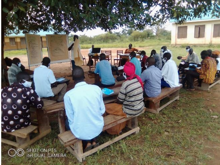
Community paralegal structures participating during training an Alternative Dispute Resolution (ADR) and mediation

FAPAD's legal aid team continued to address barriers limiting access to justice for vulnerable persons through provision of pro bono services. As such, FAPAD partnered with community paralegal structures to receive and successfully managed cases through providing free on spot legal advice to all our clients whose cases were received. FAPAD used both virtual and non-virtual means in receiving and providing free legal aid services to our clientele a cross Lango sub region.